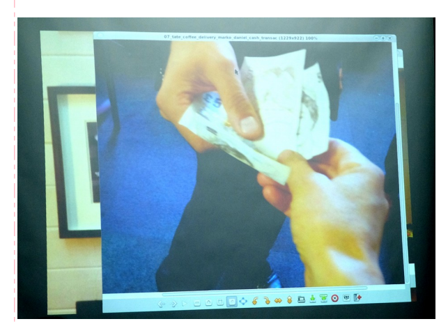
Iterations #1 : seminar at Hangar, 2017