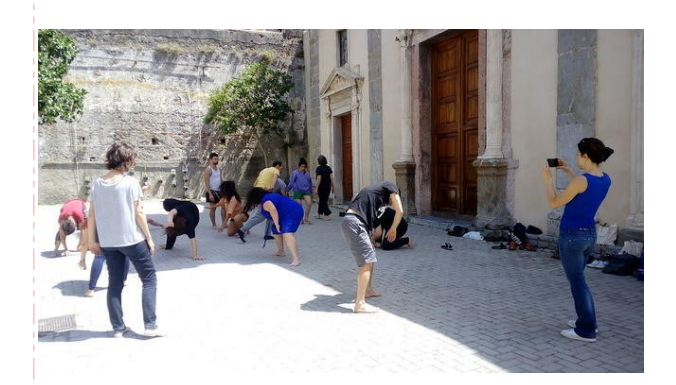
Iterations #2: Transformatorio, 2018