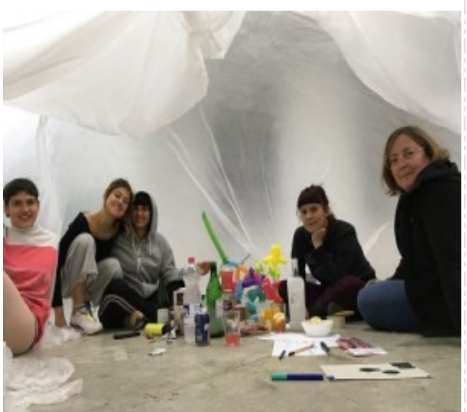
Iterations #3: residency at Hangar, 2018