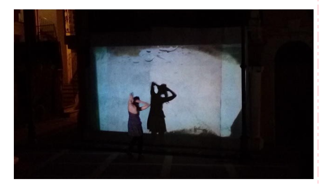
Iterations #2: Transformatorio, 2018