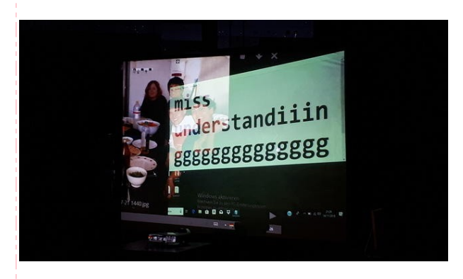
Iterations #3: residency at Hangar, 2018