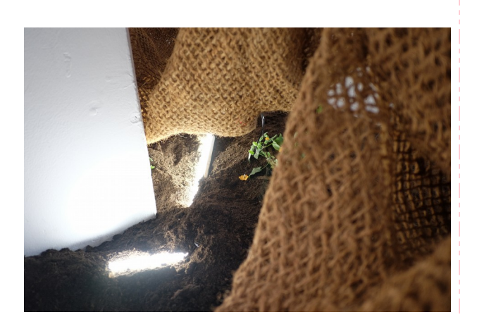
Iterations #4: exhibition at esc, 2019