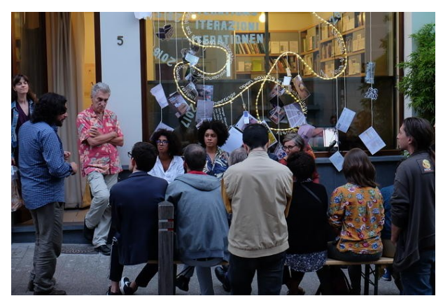
Constant_V, installation in Brussels, 2018