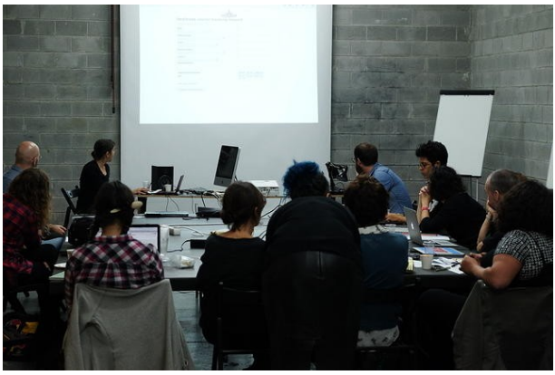
Iterations #1: seminar at Hangar, 2017