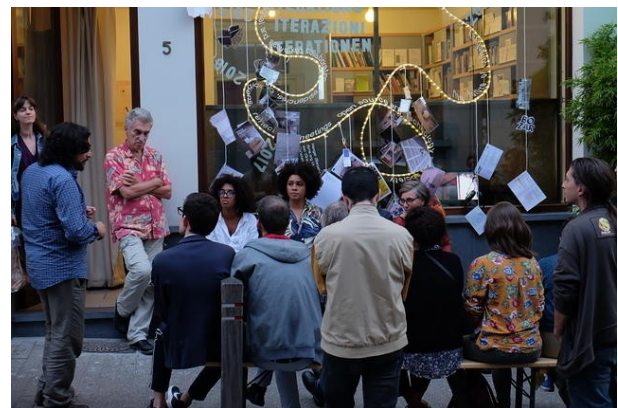
Constant_V, installation in Brussels, 2018