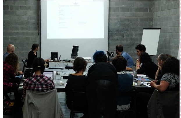
Iterations #1 : seminar at Hangar, 2017