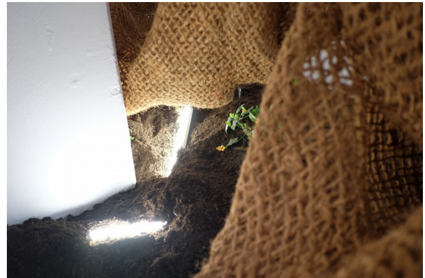
Iterations #4: exhibition at esc, 2019