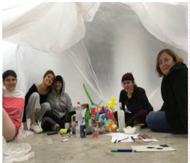
Iterations #3: residency at Hangar, 2018