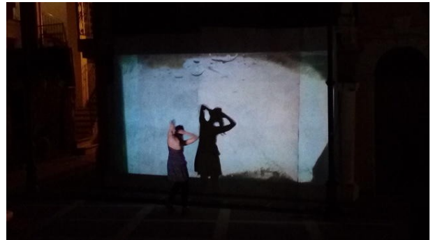
Iterations #2: Transformatorio, 2018