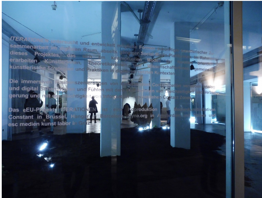
Iterations #4: exhibition at esc, 2019