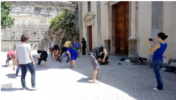
Iterations #2: Transformatorio, 2018