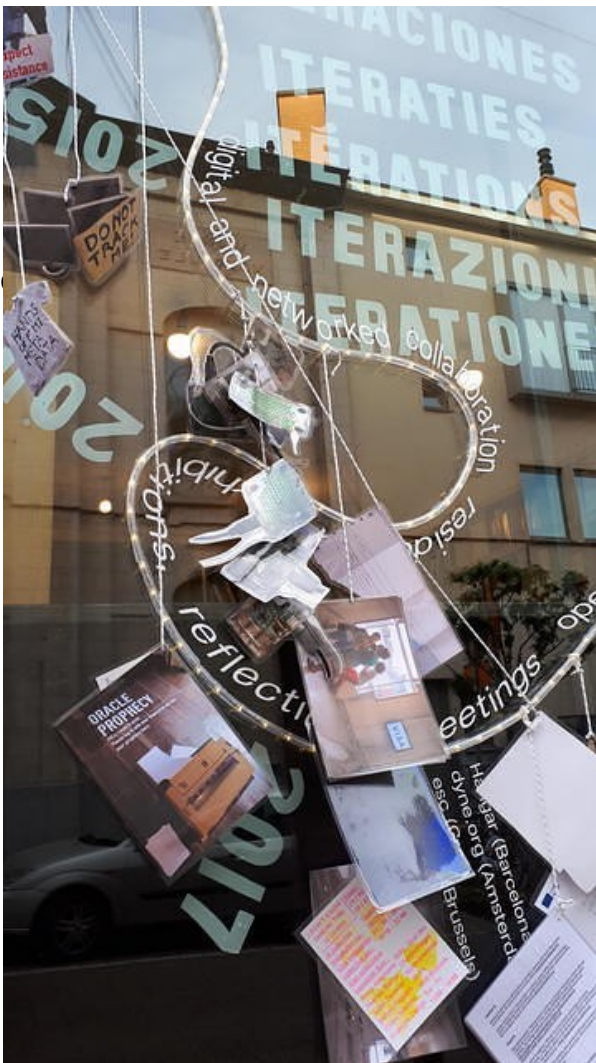
Constant_V, installation in Brussels, 2018